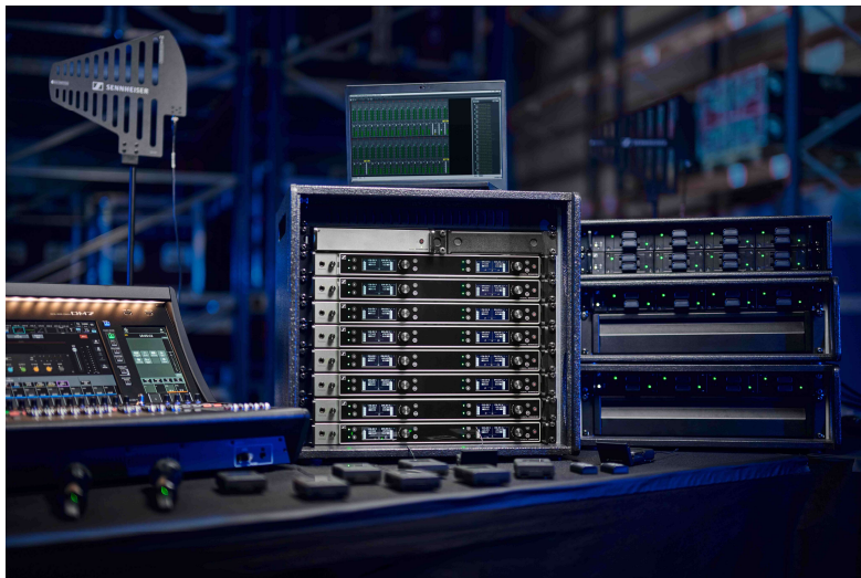
Evolution Wireless Digital EW-DX offers a comprehensive digital wireless microphone portfolio

“Evolution Wireless Digital EW-DX has been designed with ease of use in mind and offers a comprehensive portfolio to flexibly adapt to almost any digital wireless microphone need,” concludes Sikora.