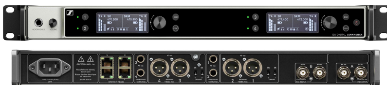
The EW-DX EM 4 Dante