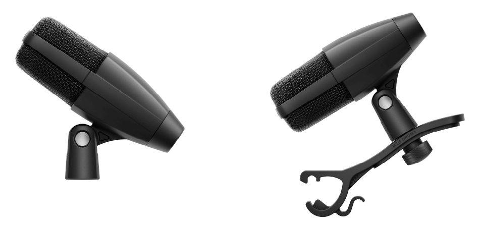
The MD 421 Kompakt (left) and the MD 421 Kompakt for Drums, which comes with additional MZH drum clamp