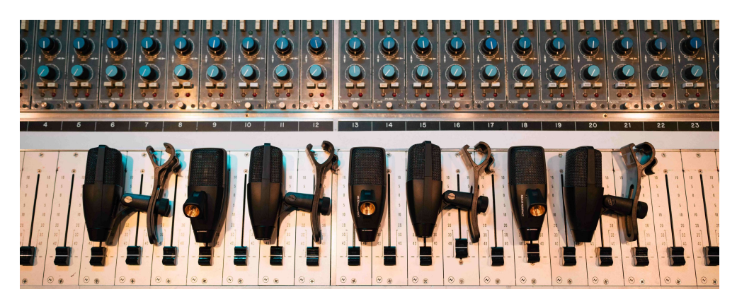
"Tämä mikrofoni soveltuu kaikkeen."

Sennheiser MD 421 Kompakt – osuvasti nimetty uutuus on kompakti versio legendaarisista MD 421- ja MD 421- II -yleismikrofoneista