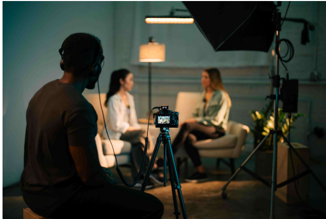
Profile Wireless used on camera in an interview scenario