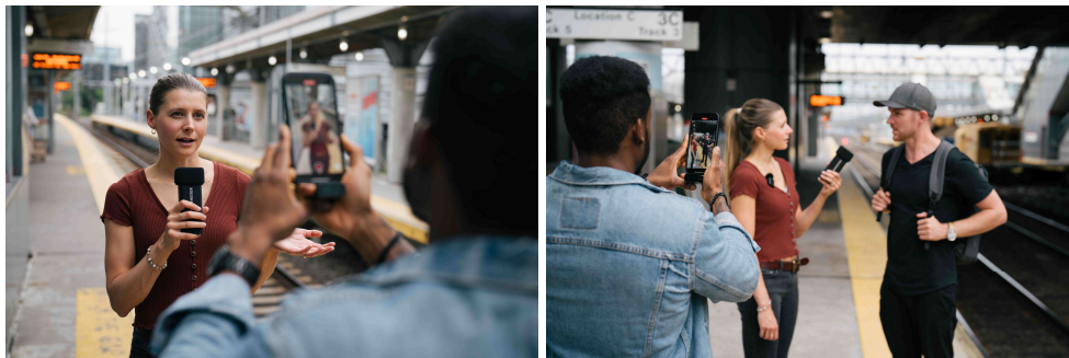
Some situations require a handheld microphone – with Profile Wireless, there is one on board

There are recording situations where a handheld microphone is an ideal choice, for example for reporter-style pieces to camera, and interviews where the creator needs more control over the conversation or is speaking with varying interviewees. For this application, the creator simply inserts a clip-on mic into the charging bar, puts the included big foam windshield on – and a fully-fledged reporter’s microphone is ready for the job.