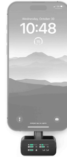
Profile Wireless used with a mobile phone to shoot vertical content