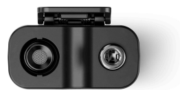
The clip-on mics of Profile Wireless feature an additional 3.5 mm (1/4”) connector for an external lav mic

When a mobile phone is used for capturing video, the Profile Wireless receiver is connected with the included Lightning or mini-USB adaptor. Thanks to a gyro-sensor, the receiver display automatically rotates by 180° to remain clearly legible.